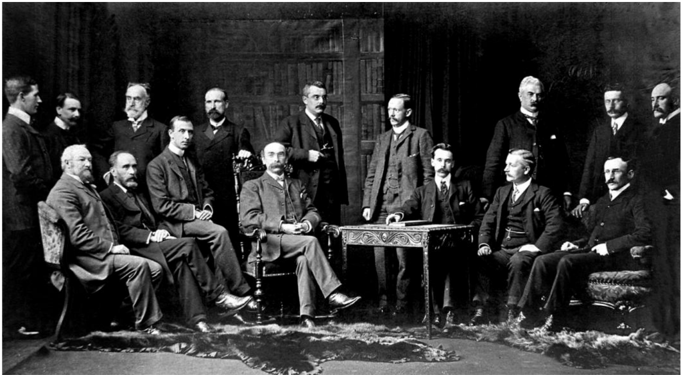
The Council of Edinburgh Photographic Society in 1902

The early years. 1861 was the year that Lincoln was elected President of the USA and the American War of Independence began. It was also the year that Edinburgh Photographic Society was founded. Photography had been practised since 1839, when William Henry Fox Talbot and Louis-Jacques-Mandé Daguerre had announced their discoveries. The Edinburgh society was originally the Photographic Society of Scotland (PSS), founded in 1856. It provided lectures, demonstrations, outings and exhibitions and its members included both professional and amateur photographers. However, despite its early success, not all members were happy with the PSS. Some found the meetings to be too formal and they began to meet informally in a small room behind a watchmaker's shop. In 1861 they formally established Edinburgh Photographic Society. In 1862, EPS elected six honorary members amongst whom was Sir William Henry Fox Talbot.